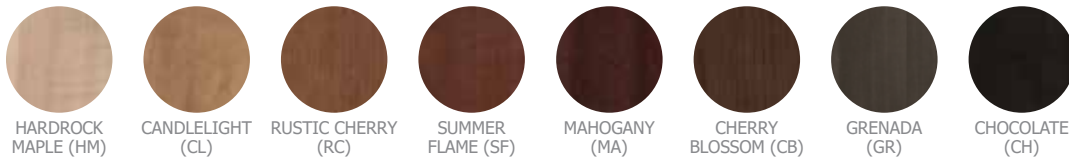
TABLE BASE FINISH SELECTION (CUSTOM FRAME FINISHES AVAILABLE ON REQUEST)