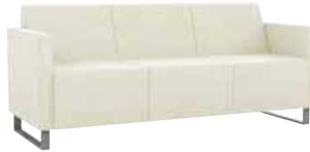
Three-seat lounge W 75.5 D 28 H 32 Seat H 18 Seat W 69 Seat D 18 Arm H 26.5