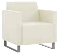
One seat lounge W 29.5 D 28 H 32 Seat H 18 Seat W 23 Seat D 18 Arm H 26.5