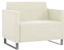
Bariatric lounge W 39.5 D 28 H 32 Seat H 18 Seat W 33 Seat D 18 Arm H 26.5