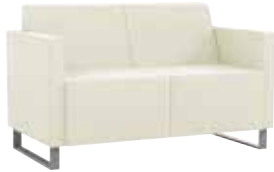
Two-seat lounge W 52.5 D 28 H 32 Seat H 18 Seat W 46 Seat D 18 Arm H 26.5