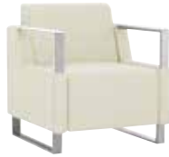
Single lounge with open arms W 29.5 D 28 H 32 Seat H 18 Seat W 23 Arm H 26.5