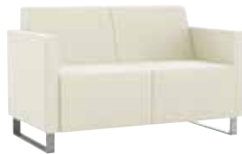
Two-seat lounge W 52.5 D 28 H 32 Seat H 18 Seat W 46 Arm H 26.5