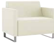
Bariatric lounge W 39.5 D 28 H 32 Seat H 18 Seat W 33 Arm H 26.5