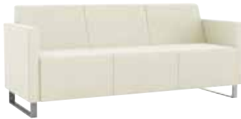
Three-seat lounge W 75.5 D 28 H 32 Seat H 18 Seat W 69 Arm H 26.5