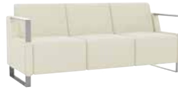
Three-seat lounge with open arms W 75.5 D 28 H 32 Seat H 18 Seat W 69 Arm H 26.5