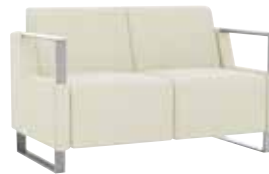
Two-seat lounge with open arms W 52.5 D 28 H 32 Seat H 18 Seat W 46 Arm H 26.5