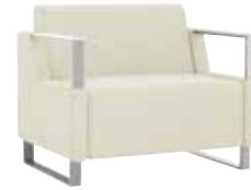
Bariatric lounge with open arms W 39.5 D 28 H 32 Seat H 18 Seat W 33 Arm H 26.5