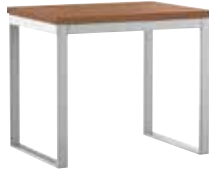
21" High Tables CFT - 1824 - 21 CFT - 2424 - 21 CFT - 2430 - 21 CFT - 2436 - 21 CFT - 2442 - 21