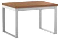
16" High Tables CFT - 1824 - 16 CFT - 2424 - 16 CFT - 2430 - 16 CFT - 2436 - 16 CFT - 2442 - 16