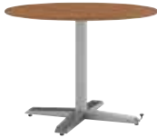
42" ROUND TOP HEIGHT ADJUSTABLE DINING TABLE