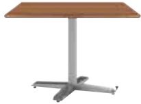
42" SQUARE TOP HEIGHT ADJUSTABLE DINING TABLE