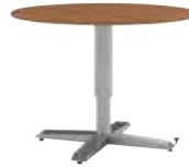
42" ROUND TOP FIXED HEIGHT DINING TABLE