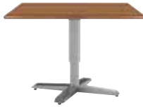
42" SQUARE TOP FIXED HEIGHT DINING TABLE