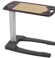
Overbed Table Model ST180-PR with Poly-resin spill top W 32 D 18 H 30/45