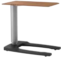
Overbed Table Model ST180-TH with Thermofoil spill top W 32 D 18 H 30/45