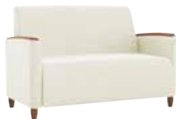
Two seat sofa W 53 D 30 H 34 Seat H 18 Seat W 46.5 Arm H 25