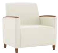
Lounge chair W 31 D 30 H 34 Seat H 18 Seat W 23.5 Arm H 25