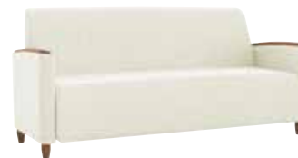
Three seat sofa W 76.5 D 30 H 34 Seat H 18 Seat W 69.5 Arm H 25