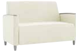
Two seat sofa W 53 D 30 H 34 Seat H 18 Seat W 46.5 Arm H 25