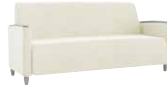
Three seat sofa W 76.5 D 30 H 34 Seat H 18 Seat W 69.5 Arm H 25