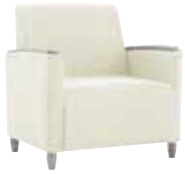
Lounge chair W 31 D 30 H 34 Seat H 18 Seat W 23.5 Arm H 25